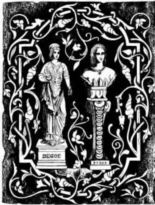
BEGOE (THE FIGURES FROM GORI MUS. ETRUS.)