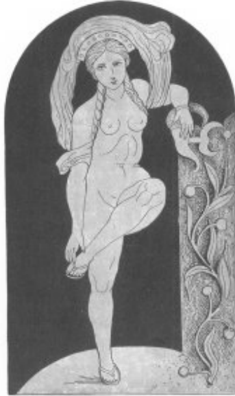
Frontispiece: TURAN, OR VENUS