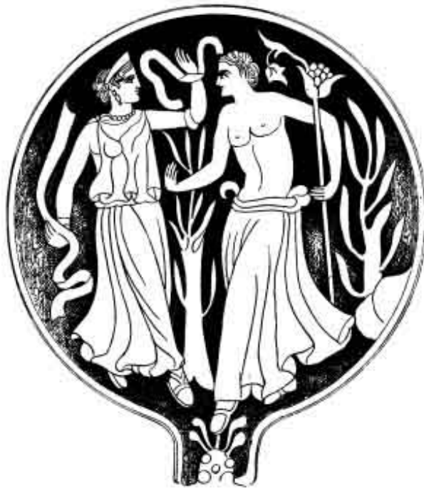
SILVANUS (SILVIANO) AND NYMPH

"Questo e to spirito Di Silvano che mi protegge!