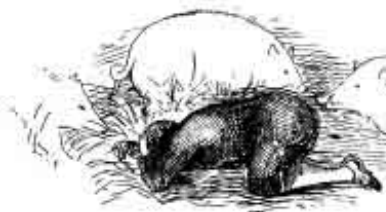
THE ATTITUDE FOR DREAMING

It is worth observing that as everything which was connected with generation or begetting, such as life, love, revival, birth, fruitfulness, and coupling of the sexes, was associated with light and reviving springtime, therefore the pig, though it was as a wild boar a symbol of death and darkness, yet because it is enormously prolific "and one of the most libidinous of animals, was sacred to Venus, and for this reason, according to the Pythagoreans, lustful men are transformed into hogs " ( De Gubernatis , vol. ii., p. 6). In fact the pudendum fem. itself, as a symbol of