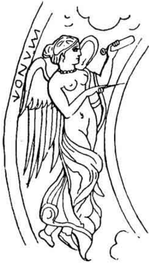
MUNTHUCHA, OR MONTULGA

TALENA--This is written Salena, I think, in the letter in which this spirit is given, but I am altogether uncertain as to the initial. She is thus described:--