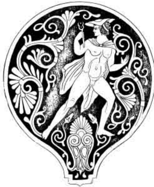
TÉRAMÓ (TURUS; MERCURY)

Græco-Roman--of a horrible or malevolent nature, and a number of them wielded thunder and dealt largely in storms and hail. All of which in due proportion the