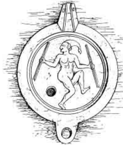
RED-CAP ON A ROMAN LAMP

sprite who guarded treasures, and sometimes, under compulsion, showed where they were hidden, as is shown in another chapter. All of which--as with everything else in this work--I submit as material only, the real value of which others must determine.