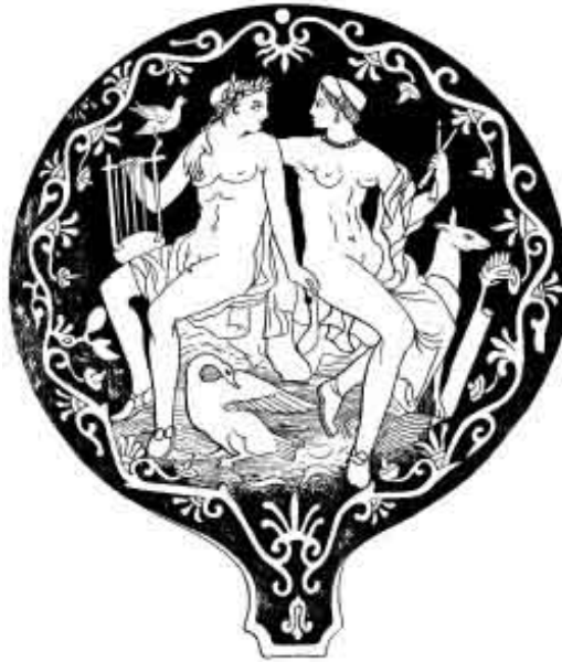
APLU (APOLLO) AND ARTEMISIA

It was a long time before I could find out this now almost forgotten name but one day it came forth as if by chance or inspiration, and then I was told the following details:--