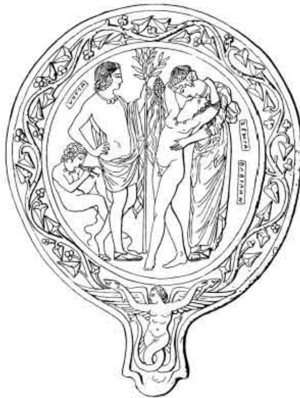
APLU, FUFLUNS, AND SEMELE

This reminds me of the task on which I am engaged. If it were only to gather, collate, and correct a collection of fairy tales, or proverbs, or parables,