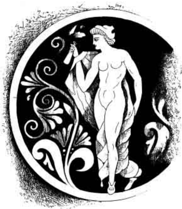
LASA, OR GUARDIAN SPIRIT

in the course of time has become obscure, owing to confusion with the others. The rural Lares, on the other hand, are those which in the very ancient song of the Arval brothers are called on as E nos Lases iuvate ."