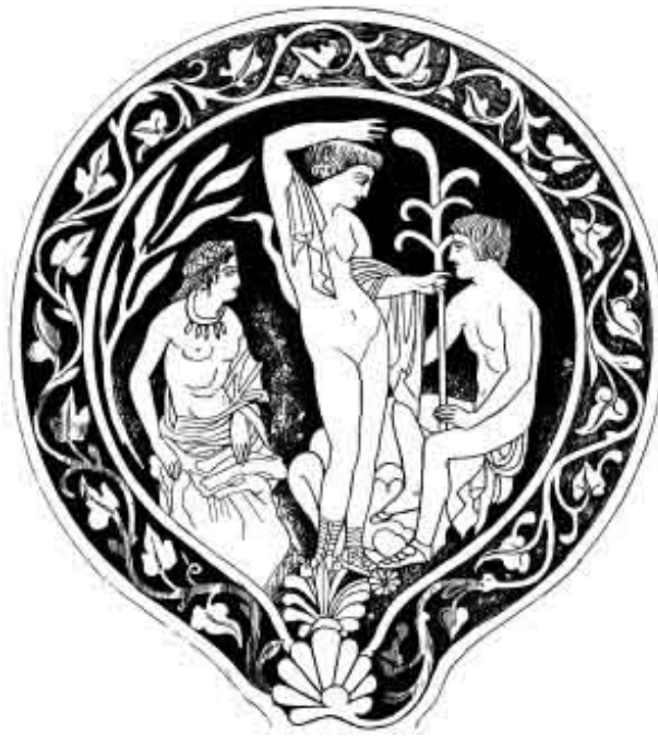
ETRUSCAN RURAL DEITIES

Madonnas, and the agony of tortured saints with no end of fasting and prayer, are not congenial to us, nor did healthy humanity ever accept them in loving earnest, as it did the old heathen gods. The whole history of the Middle Ages--or