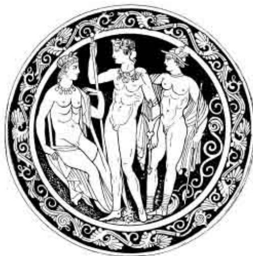
APLU TINIA TÉRAMÓ

come from melting some other coin or medal or object which was primævally old, ere ever he who bestrode the world, like a Colossus, was born. The ruder a bronze, the older it may be; so it may befall that these rough legends touch the night of time. True it is that there are rude things also of later date, and such