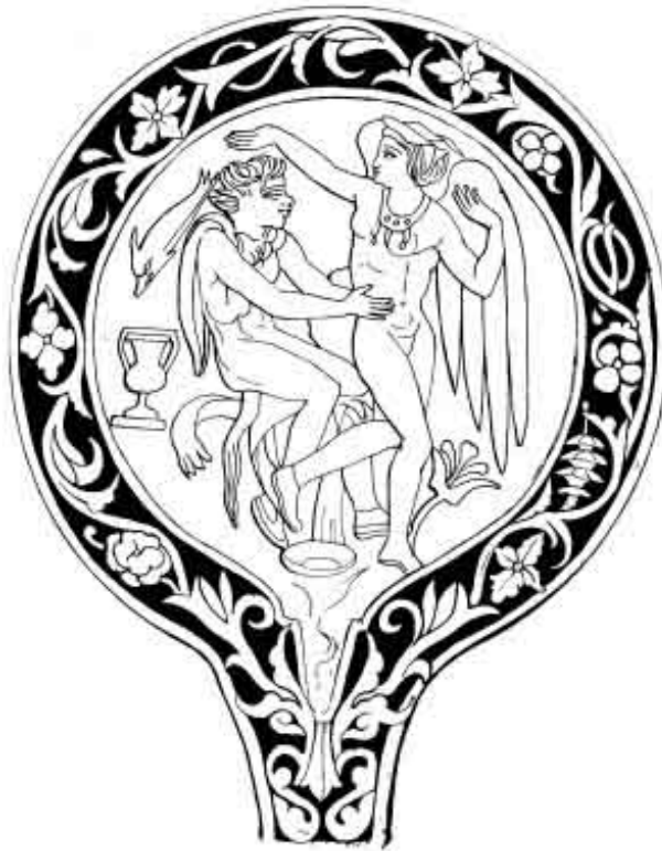
FAUN AND FEMALE LASA OR FAIRY