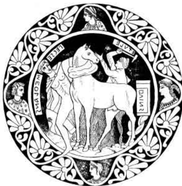
SETHLANS, VULCAN, AND THE TROJAN HORSE

Querciola, or Querciola, as the name of a nymph or sylvan spirit, is clearly enough closely connected with that of Querquetulana , an old Roman or Italian simile for Vira (which see), a wood-nymph; though the term, like Querciola,