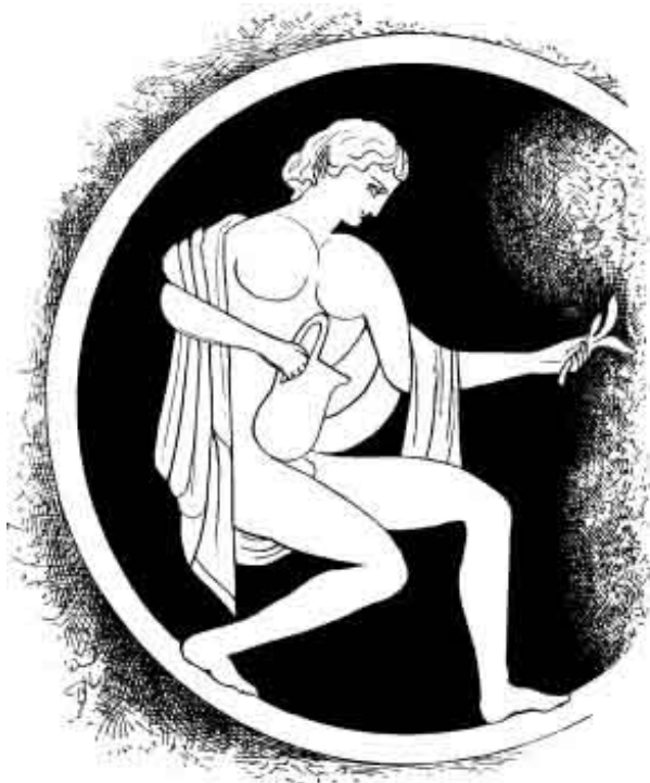
FAUN (On a patera. (Etruscan) Museum, Florence.)

"To the Incubus and Succubus was joined the Nightmare in the Accadian Kiel-udda-karra , in the Assyrian, Ardat . . . . It is probable, judging from its name, that it was one of those familiar spirits which